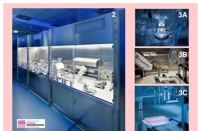
Fig. 3: (A) Cell Extraction of primary keratinocytes from human biopsies; (B) Cell Expansion of primary keratinocytes in monolayer culture; (C) Tissue Cultivation: build-up of the 3D OS-REp model

testings, to our knowledge for the first time in the framework of alternative methods. It will be extended to other alternative methods, e.g. a human corneal equivalent for eye irritation testings in the near future.